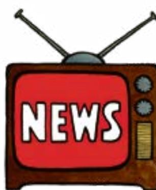
THIS IS THE TRUTH