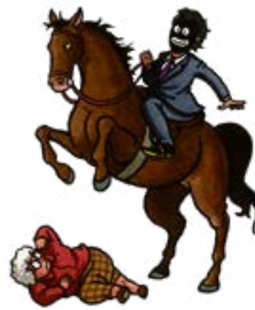
THIS IS A DEMOCRAT