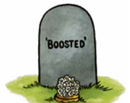
THIS IS A COINCIDENCE