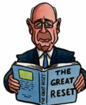
THIS IS A CONSPIRACY THEORY