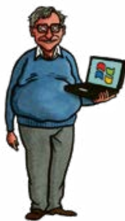
THIS IS A HEALTH EXPERT