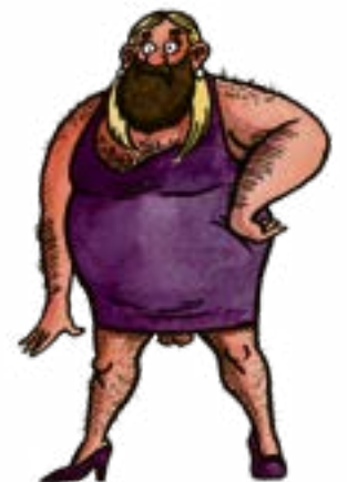
THIS IS A WOMAN