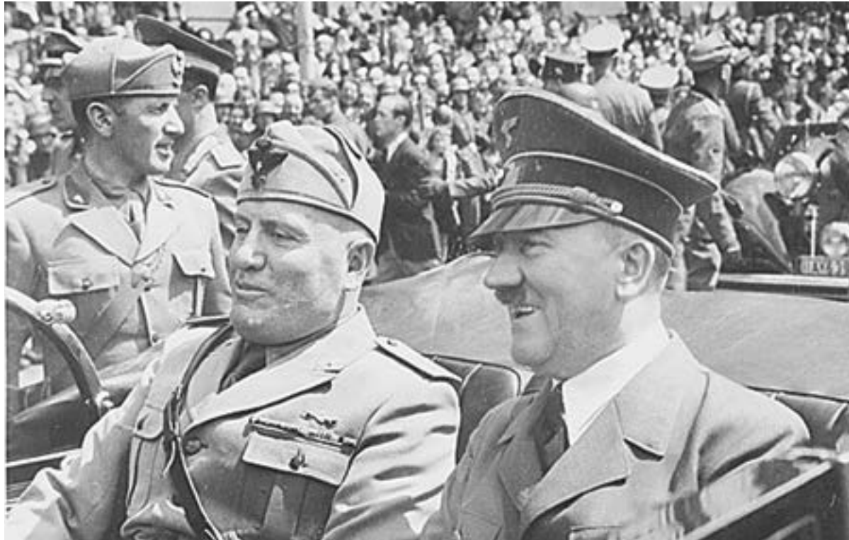
Left to right: Benito Mussolini and Adolf Hitler 1940

The late Italian economist, sociologist and world systems analyst, Prof Giovanni Arrighi, quotes the above passage from Gramsci’s Prison Notebooks in his book, The Long 20th Century , where he refers to the work of anthropologists Edward Evans-Pritchard and Max Gluckman with