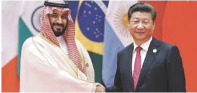
Saudi Crown Prince, Mohammed bin Salman with Chinese President, Xi Jinping

One particularly eye-catching aspect of the agreement was a deal with the Chinese tech giant, Huawei, to supply the Saudis with cloud