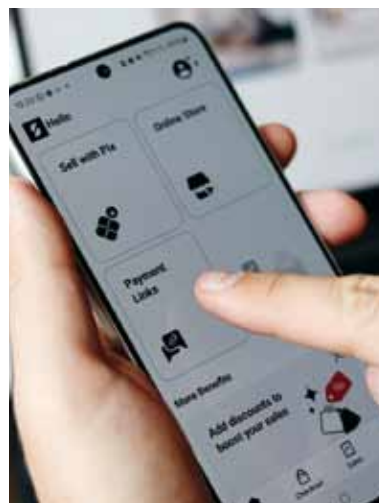
There will be restrictions on what we spend.

This architecture has precedents. The 'positive money' movement has long advocated for central bank digital currency as the monetary base, removing commercial banks' ability to create