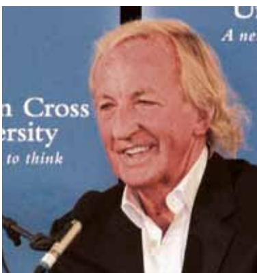
John Pilger (pictured)

"The main parliamentary parties are now devoted to the same economic policies and the same foreign policy of servility to endless war."