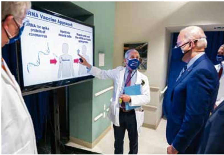
Dr Anthony Fauci with former US President Biden in 2021.

2020: Dr. Fauci began holding secret meetings at CIA headquarters "without a record of entry" in order to "influence its Covid-19 origins investigation," according to a whistleblower. "He knew what was going on...He was covering his ass and he was trying to do it with the Intel community," the whistleblower told Congress.