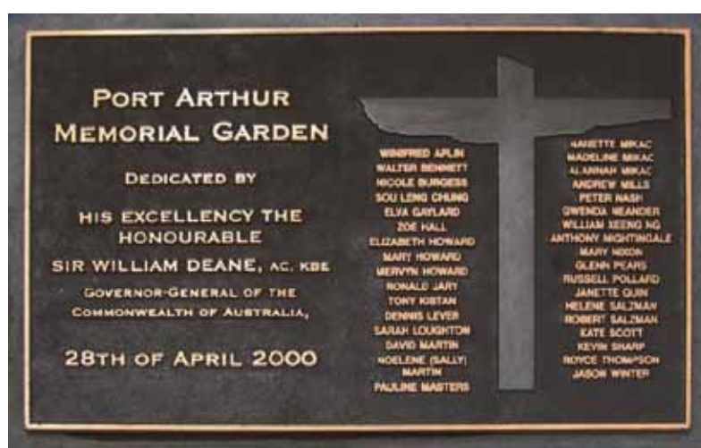
Commemorative plaque honouring those who lost their lives in the Port Arthur Massacre.

excessive speculation and let information ignored or sidelined by mainstream sources tell its own story.